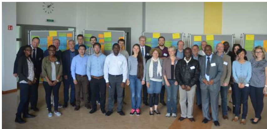
Brain Storming Workshop at TU Bergakademie Freiberg

divided into working groups consisting of 3 to 4 members. Each group was required to contribute topics and associated measures they thought were important for the development of the Centre. In total, 78 topics were generated. Next, the participants identified their preferred topics and assigned different levels of priority to each topic. The 78 topics were sorted into nine categories. The most preferred category was ‘Teaching and professional training’. Many topics generated from the workshop have been used as input in the CEMEREM II proposal.