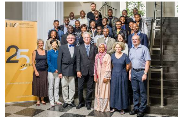
CEMEREM Summer School at HTWD

In Dresden, visits were made to DREWAG power (Combined Heat and Power) station at Nossener Brücke. The group were given an insight into electricity generation and heat recovery technologies with an overall efficiency of close to 90%. The power generator’s business model was also explained to showcase the optimal cash flow generation. A visit to the Hosterwitz Waterworks revealed the general concept of treating bank filtrate to provide drinking water.