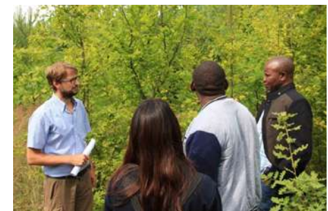
Visits to Welzow open pit mine