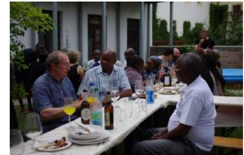
Administrators Training at HTWD

Together with Summer School participants, the delegates visited the