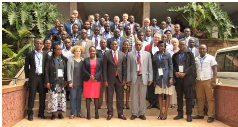
The Frist CEMEREM Conference in Nairobi, Kenya

All in all, organizers and attendants considered this event to be successful, expressing their desires to have similar conferences in the future.