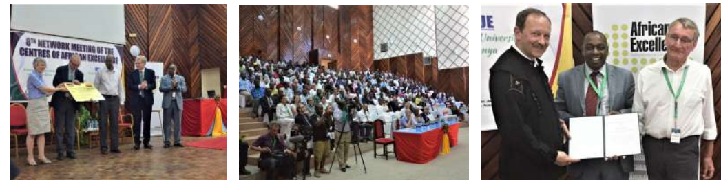
CEMEREM Opening Ceremony at TTU

the universities as well as the business community. All participants unanimously concluded that CEMEREM is a fundamental step in the right direction for its novel opportunities in students’ education and training for the various roles needed in Kenya’s growing raw material sector.