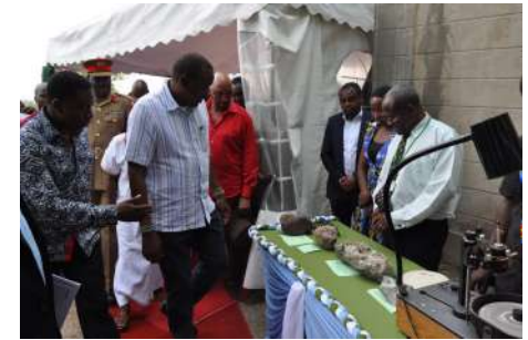
The president being taken through the Mining stand by the Cabinet Secretary Ministry of Mining Hon. Dan Kazungu

The president welcomed the start-up of a Mentorship and Internship programme for students on Management in Government which he promised soon to roll out beginning with TTU students.