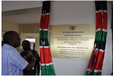
His Excellency Hon. Uhuru Kenyatta officially inaugurating the National Mining Institute

The National Mining Institute was founded by the Government as a training institution for the extractive sector with the aim of increasing the number of Mining Engineers not only in the Country but in the Eastern Africa region. Subjects include Process Engineering, Metallurgy, Material Science, Mineral Economics and Geotechnical Engineering.