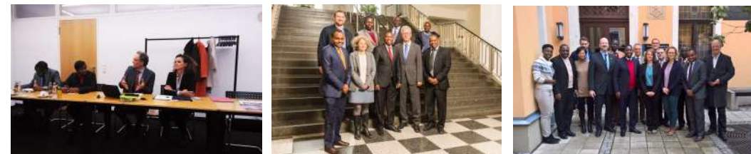
Visits to DAAD Office Berlin, SMWK in Dresden, TU Bergakademie Freiberg