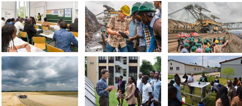
Visits to Welzow open pit mine, TU Bergakademie Freiberg, Agrargenossenschaft Clausnitz

The last day of the seminar was devoted to closing remarks, handing out awards for the best posters and a discussion about the overall evaluation of the seminar in view of similar future events.