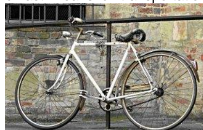
Bicycles are a popular means of transportation among the students

E-Mail: kerstin.braun@cjd.de / bernhard.wolf@cjd.de