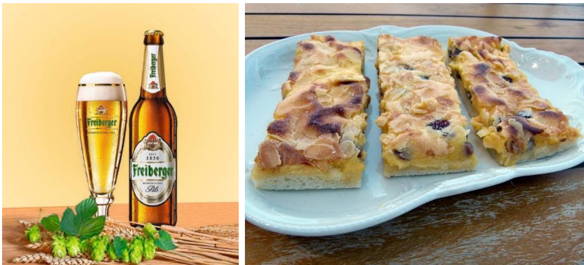
Freiberg Beer and Freiberger Eierschecke (cake) are typical specialities you should try