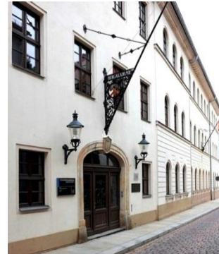
Main Building, Akademiestr. 6 Location of the Student Office (see Uniwegweiser No. 1)