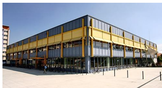
Neue Mensa (please see „Uniwegweiser“ No. 48)

The canteen is located on the university campus. There are always five dishes to choose from, which cost between 2 and 4 euros. Among them, there is at least one vegetarian dish. In addition, a soup of the day and different desserts are offered. You can also choose dishes from a pasta and salad counter.