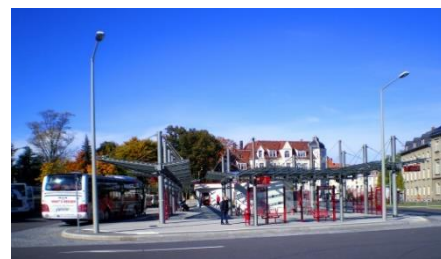
Central bus station Freiberg, Wernerplatz / Roter Weg

In Freiberg, there are different regular bus lines to get around Freiberg. A ticket for one zone (e.g. Freiberg) costs 2.70 € and is valid one hour beginning with the purchase. You can buy the ticket from the bus driver. Fares, schedules and timetable information can be found at: http://www.regiobus.com/?id=47