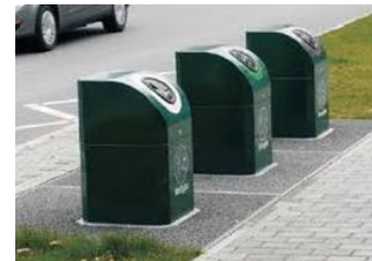
Containers for waste glass

Waste glass (without deposit) is collected in glass containers, which can be found in the urban area, usually at the edge of main roads. There are always three bottle banks according to the colour of the glass white, green and brown. Glass with different colours (e. g. blue) goes into the “green” container.