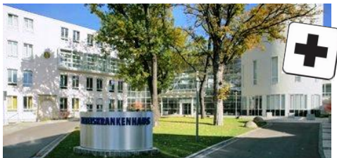
Hospital Freiberg, Donatsring 20 (please see hospital symbol at „Uniwegweiser“)

If you do not know where else to go, you can go directly to the emergency room of the hospital in Freiberg. However, please be prepared for a long waiting time when your situation is non-life-threatening.