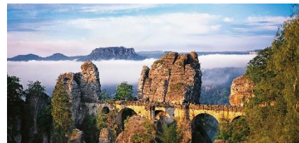
Panorama of Dresden, Bastei in Saxon Switzerland