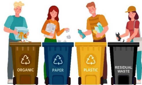
Dustbins for waste separation

Restmüll is the waste that does not belong to paper, glass, packaging and organic waste.