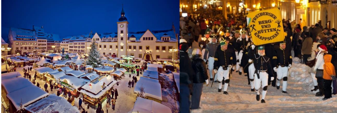
Freiberg Christmas market and the great miners parade

https://www.freiberg.de/kultur-und-tourismus/veranstaltungen