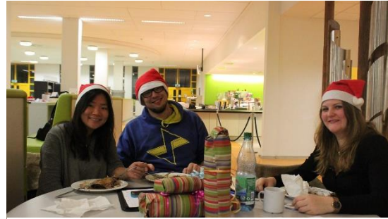
AKAS during International Christmas