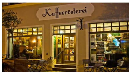
Kaffeerösterei Momo, Korngasse

The restaurants in Freiberg offer a variety of different cuisines. Most of them offer typical German and Saxon meals, while others serve Italian, Greek, Chinese, Asian, Russian, Turkish, Indian and Oriental meals. Most of the restaurants can be found in the city centre or close to it.